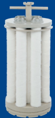
Cartridge filter assembly