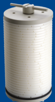
Disc filter assembly