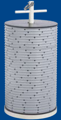
Disc Filter Assembly