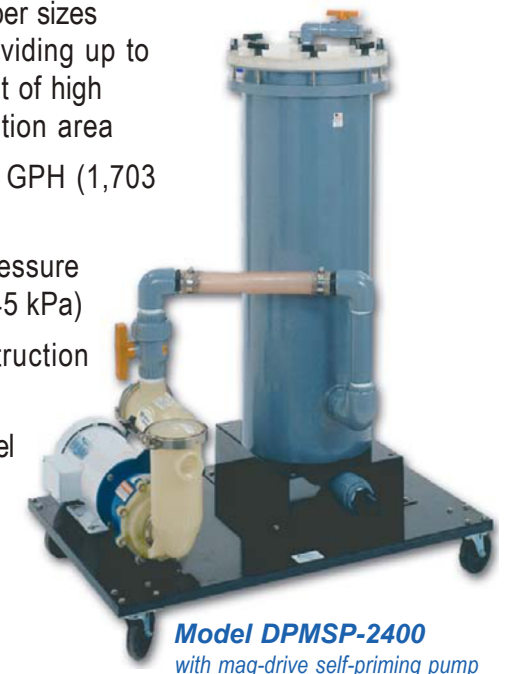
Model DPMS-2400 with mag-drive self-priming pump