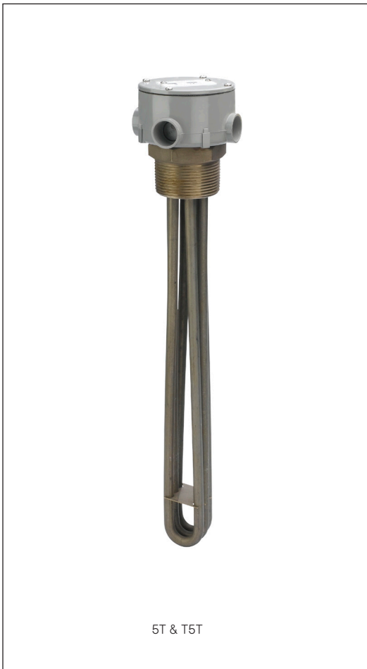
5T & T5T

Durable, efficient, chemical, screwplug heater in 316 stainless steel or titanium elements for use in most aqueous alkaline solutions and rinse tanks. 2 1/2 inch. 4500-18000 watts, 240-480 volts.